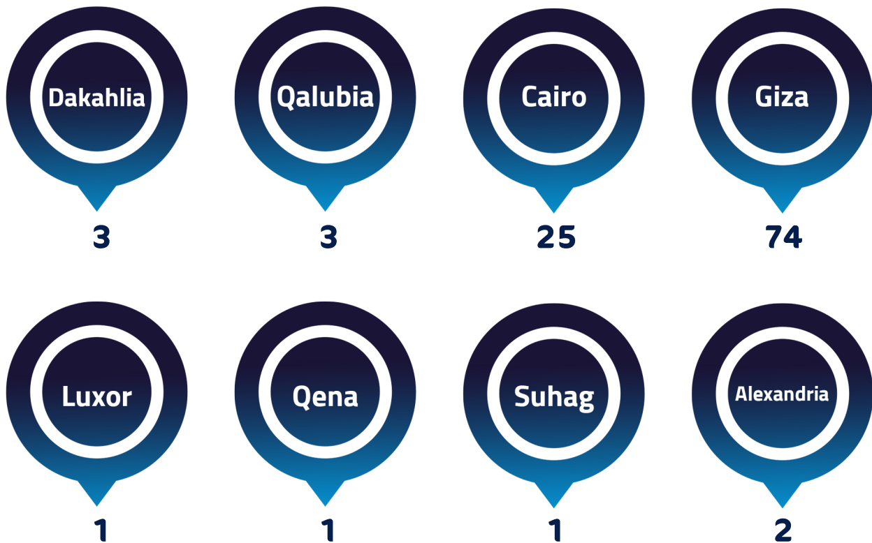
Shape No. (7) Distribute violations according to the "Geographical Scope"