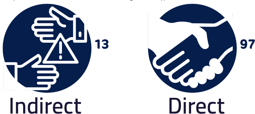
Shape No. (1) Distribute violations according to the "Type of Documentation"

Males were the most vulnerable to the violations in the 4th quarter of the past year 2020 as they were exposed to about 68.2% of the total violations comparing to 27.3% of the violations occurred for females, while about 4.5% of the total violations were documented as unspecific because they occurred to the Online newspapers.