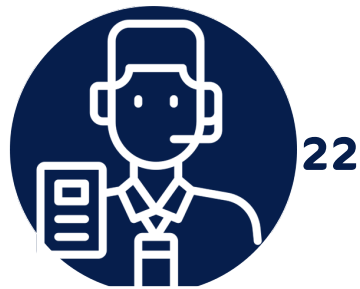
Shape No. (3) Distribute violations according to the "Journalist's Specialization"

The photojournalists were the most vulnerable to violations as they were exposed to about 63.6% of the total violations, meanwhile about 20% of the total violations against journalists. It was recorded about 4.5% of the total violations against editors, 3.7% against reporters and similar to them against unspecific agencies, 2.7% against broadcasters and about 0.9% against (editor in chief and media institution).