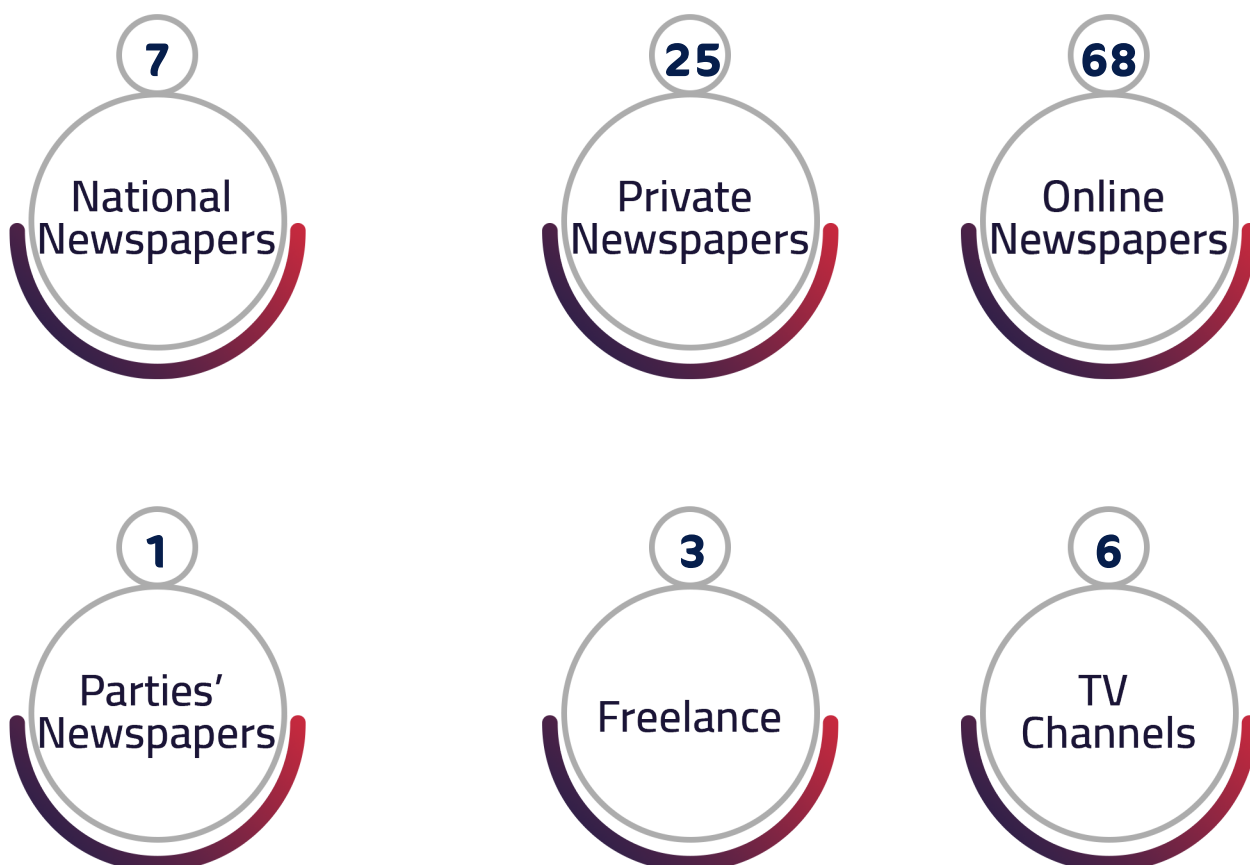
Shape No. (4) Distribute violations according to the "Journalist's Work Place"

During the 4th quarter of 2020, the journalists and media professionals were exposed to various types of violations, the most distinguished were prevention from journalistic and media coverage with 64.5% of the total violation cases, followed by the inappropriate treatment with 12.7% of the total violations. It was also recorded about 3.6% of the violations where the journalistic and media contents were removed, while about 2.7% for each (Verbal abuse, Arbitrary dismissal), 1.8% of the total violations for each (suspension from work, suspending a TV program, blocking material rights) and finally 0.9% of the total violations was recorded for each (Hacking a website, verbal threaten, blocking a website, stealing personal belongings, imposing a fine, preventing from a headquarter entrance, preventing from being appeared, arresting and charging).