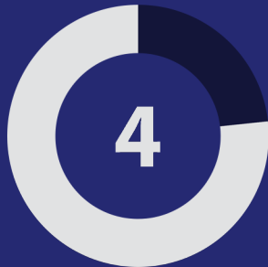
Case No.1365 of 2019 Supreme