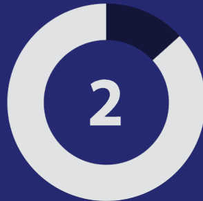
Case No.855 of 2020 Supreme