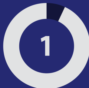
Shape (1) Classification of imprisoned journalists according to the cases for which they are being tried